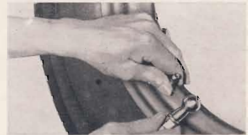
After the tire is fitted on the rim, inflate the tire to press the beads tightly against the rim flanges