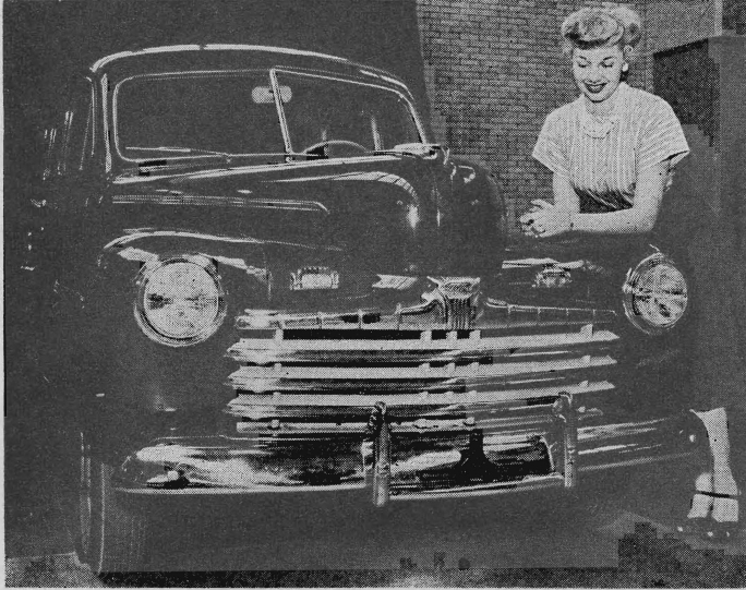
Front of the 1946 Ford, above, looks different from 1942 models due chiefly to changes in the radiator grille, parking lights, and trim.