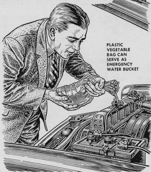
PLASTIC VEGETABLE BAG CAN SERVE AS EMERGENCY WATER BUCKET