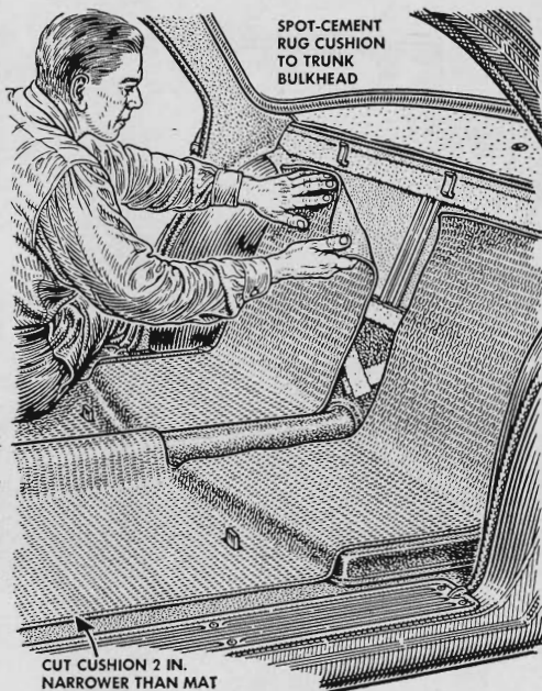
SPOT-CEMENT RUG CUSHION TO TRUNK BULKHEAD