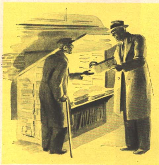
For 20 years he'd run a newsstand in front of the Park House.