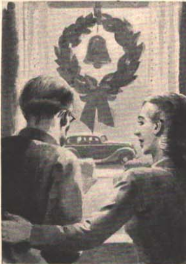
She had been planning to have the car outside the house to surprise him when he came downstairs Christmas morning.

"Oh, that's because the oil isn't leaking," Gus said vaguely. "Merry Christmas!"