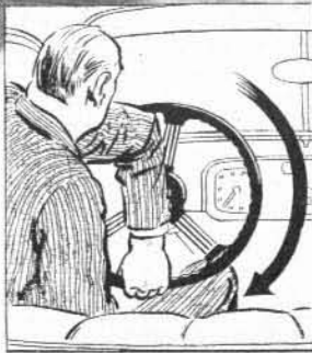
2- End of turn ..