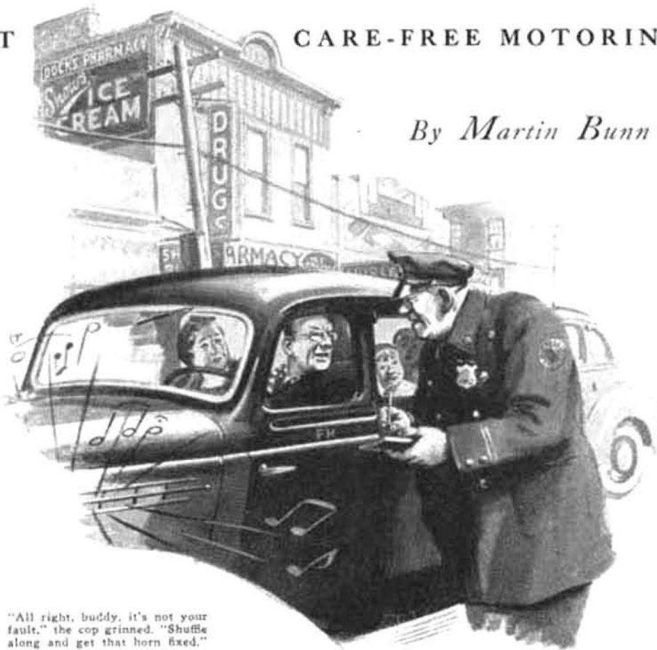
"All right, buddy, it's not your fault," the cop grinned. "Shuffle along and get that horn fixed."

While he was fumbling with the buttons of his overcoat and the cop was digging for his summons pad and pencil, the horn let loose upon what promised to be