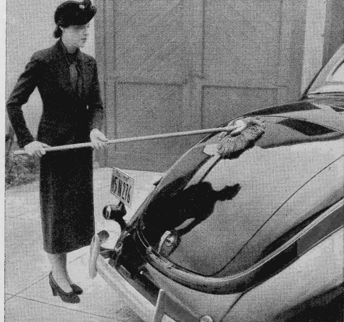
Last-minute polishing can be done easily without soiling the clothes