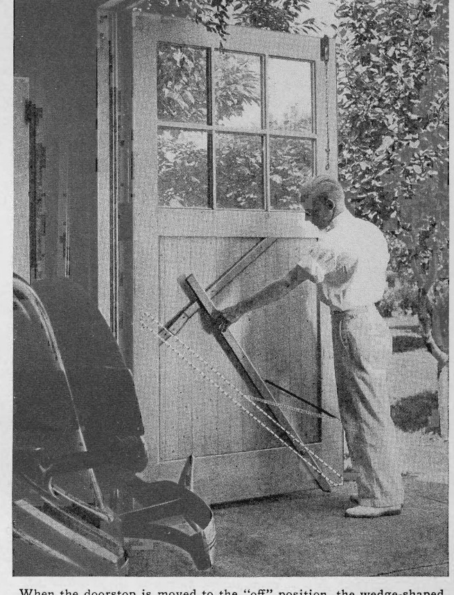
When the doorstop is moved to the "off" position, the wedge-shaped wooden block serves to hold it in place, as shown by dotted lines