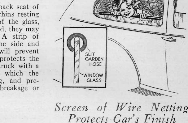
Screen of Wire Netting Protects Car's Finish

a car, often sit with their chins resting directly on the bare edge of the glass, and if a bump is encountered, they may and if a bump is encountered, they may receive a painful injury. A strip of garden hose, split down one side and slipped over the window will prevent such an accident. It also protects the glass, taking the shock if struck with a toy or other object with which the youngsters may be playing, and preventing the possibility of breakage or chipping.—W. H.