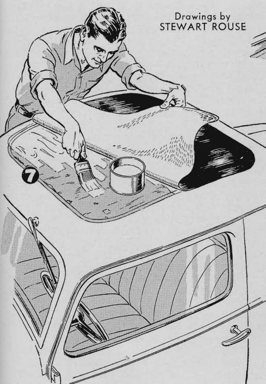
Drawings by STEWART ROUSE

7 INEXPENSIVE TOP REPAIR on old-style closed cars can be accomplished with ordinary black oilcloth and a quarter's worth of waterproof casein glue. Cut the oilcloth to fit over the fabric top and lap over onto the metal about 1/2". Apply the glue with a brush, a section at a time, drawing the oilcloth tight as it is laid on. With care, a neat-looking job can be done.—J. D. G.