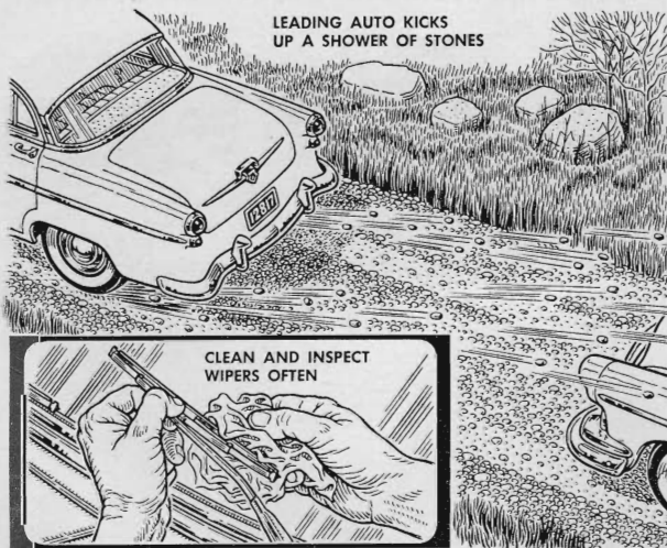
LEADING AUTO KICKS UP A SHOWER OF STONES

To remove a generator pulley without damaging it, loop the fan belt around the groove and grip it firmly while you loosen the nut. If the nut is stubborn, use an old fan belt and lock it in a vise to get a tighter grip on the pulley.