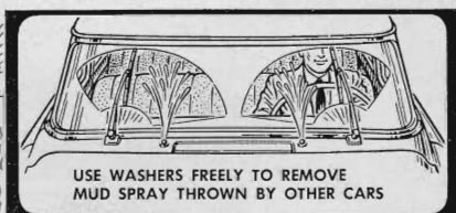
USE WASHERS FREELY TO REMOVE MUD SPRAY THROWN BY OTHER CARS